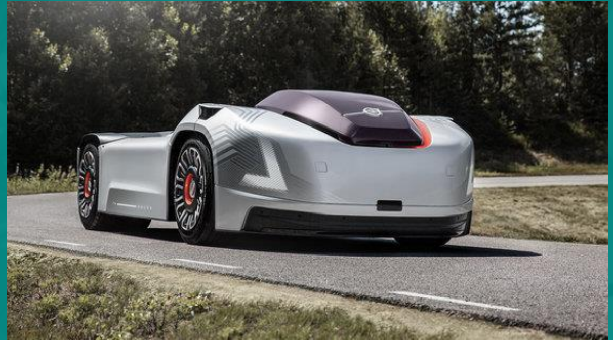
Volvo Group – VERA