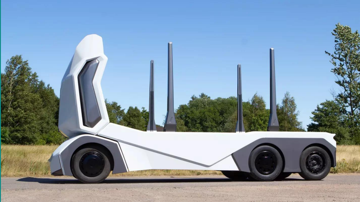
Einride – T-log