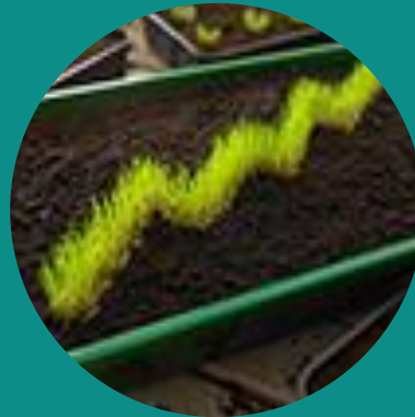
Circular and Biobased Economy