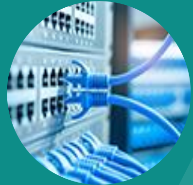
Connected Industry and New Materials