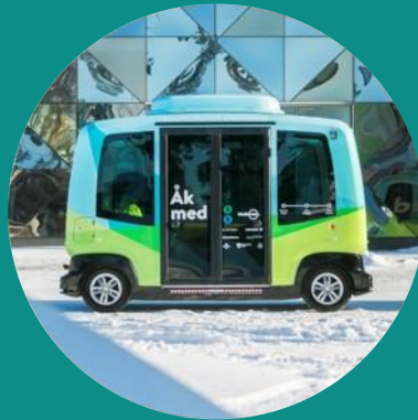
Next Generation Travel and Transport